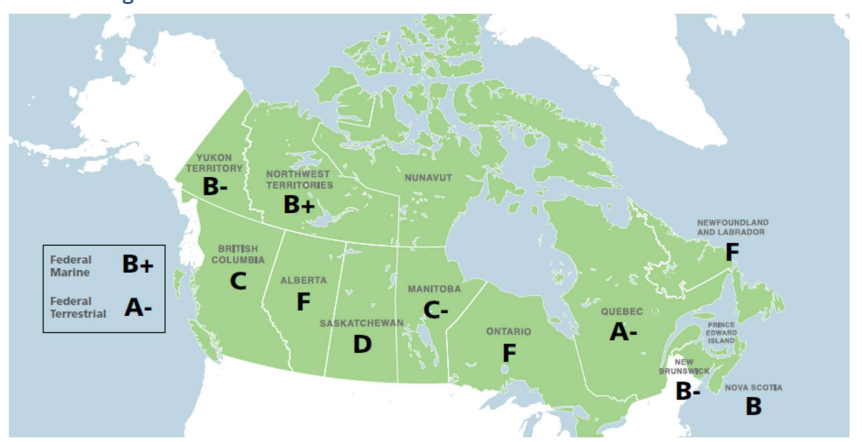
Image 2. Grades according to Canadian Parks and Wildness Society (2021) report card on protected areas by jurisdiction<sup>82</sup>

Currently, the Ontario government has not recognized any IPCA as existing within the province, including among its 520 parks and conservation reserves. There are some projects however, between Indigenous communities and the federal government and Parks Canada, which aim to establish IPCAs. These examples, detailed below, are illuminating in understanding how Indigenous nations have sought to advance joint Crown-Indigenous conservation efforts.