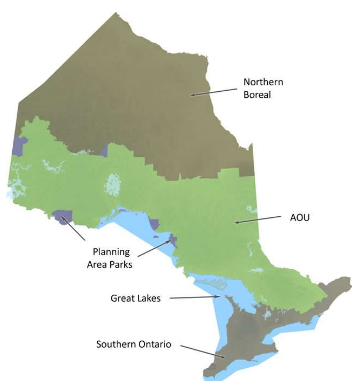
Image 6. Map of 'Area of the Undertaking' setting out where forestry practices can occur in Ontario (Source: online)

In the Far North part of Ontario, the Far North Act provides a mechanism for First Nations to engage in a land use planning process with Ontario, where both parties must agree on land use designations and where new protected areas can be identified. This provides more flexibility in setting land use designations and in defining First Nation priority areas as protected from industry. There is also a mechanism for First Nations to request a withdrawal of unencumbered lands within large planning areas from mining activity during land use planning processes. While some First Nations have made use of the Far North Act , many have pointed out that it was imposed on First Nations by the Crown, does not recognize First Nations jurisdiction, and the Minister retains final discretion.