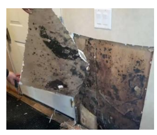
Infrastructure – Housing Crisis