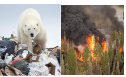
Community Safety – Evacuations, Displacement