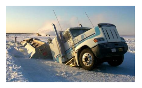
Transportation, Connectivity & Accessibility to Services