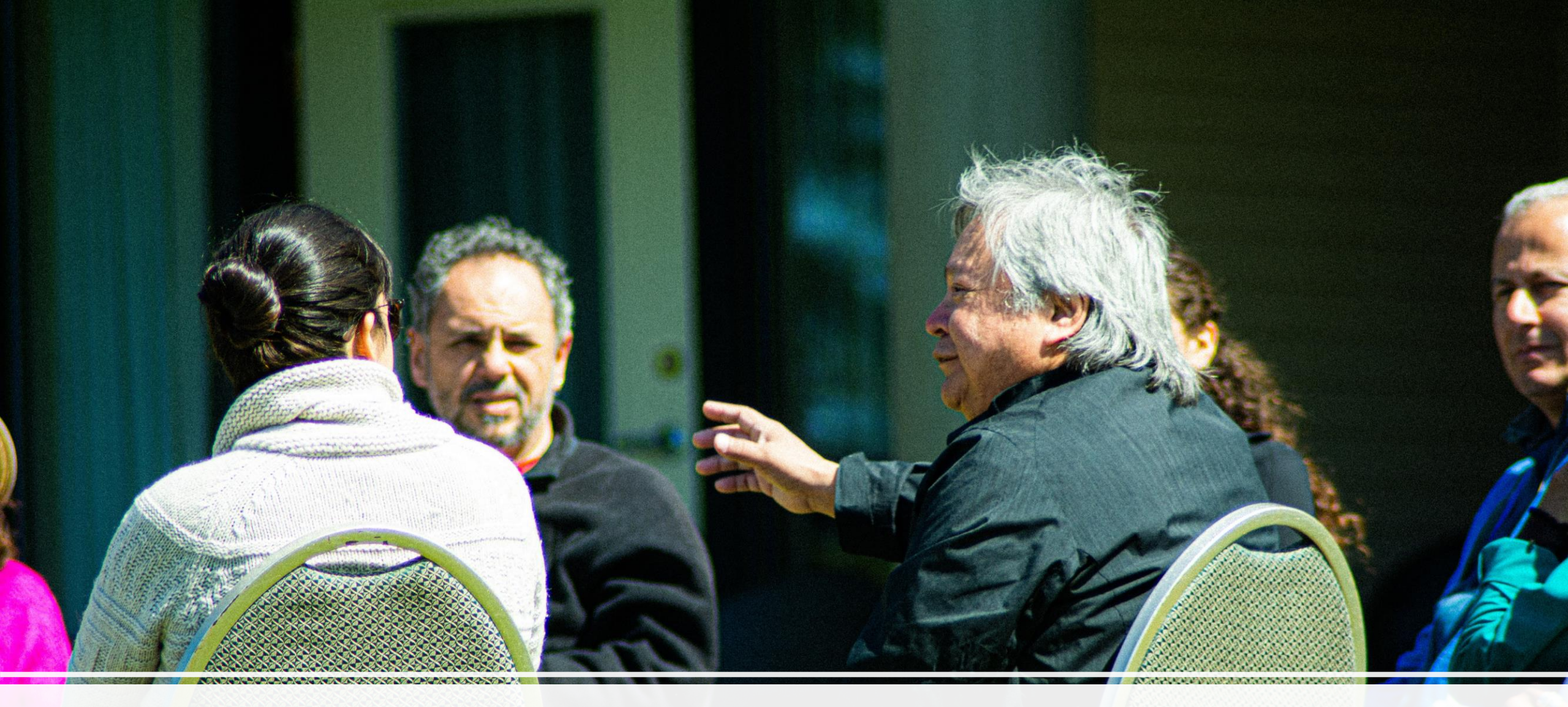
The intersection of Climate Change and Indigenous People