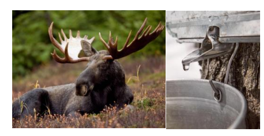
Sustenance, Food Security & Harvesting Cycles