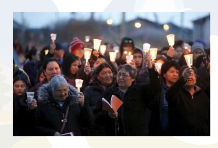
Social – Loss of Cultural Practices & Suicide Crisis