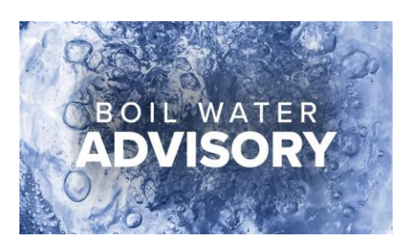
Water Quality & Quantity Issues