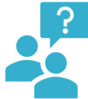
Lands Advisory Committee