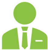
Lands Dept Staff