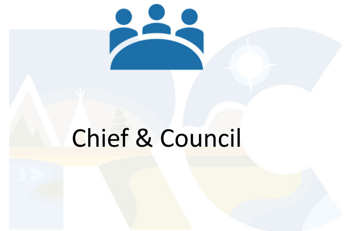
Chief & Council