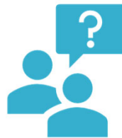
Lands Advisory Committee